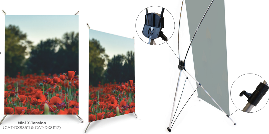
custom printing available